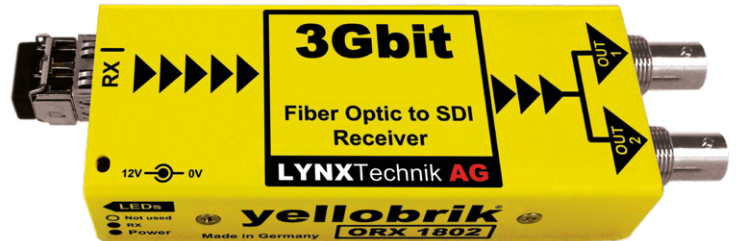
ORX 1802-2 LC Version Shown