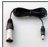
XLR 1000 Use with a standard 4 pin XLR camera battery power source.