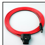
P-TAP 1000 Use with a standard battery P-TAP power source.

The kit INCLUDES AC power supplies. The power adapters below are optional.