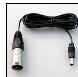
XLR 1000 Use with a standard 4 pin XLR camera battery power source.