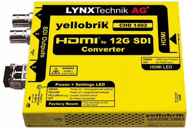
Shown with optional fiber SFP installed