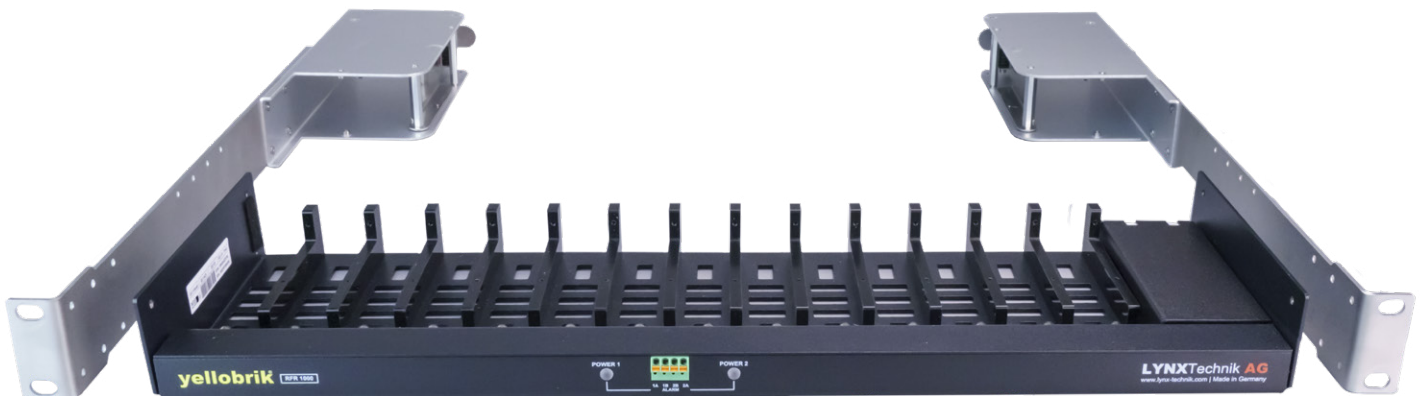
2 RXT 1001 displayed with RFR 1000-1

Includes 1x power supply holder, 1x mounting bracket, 4 screws