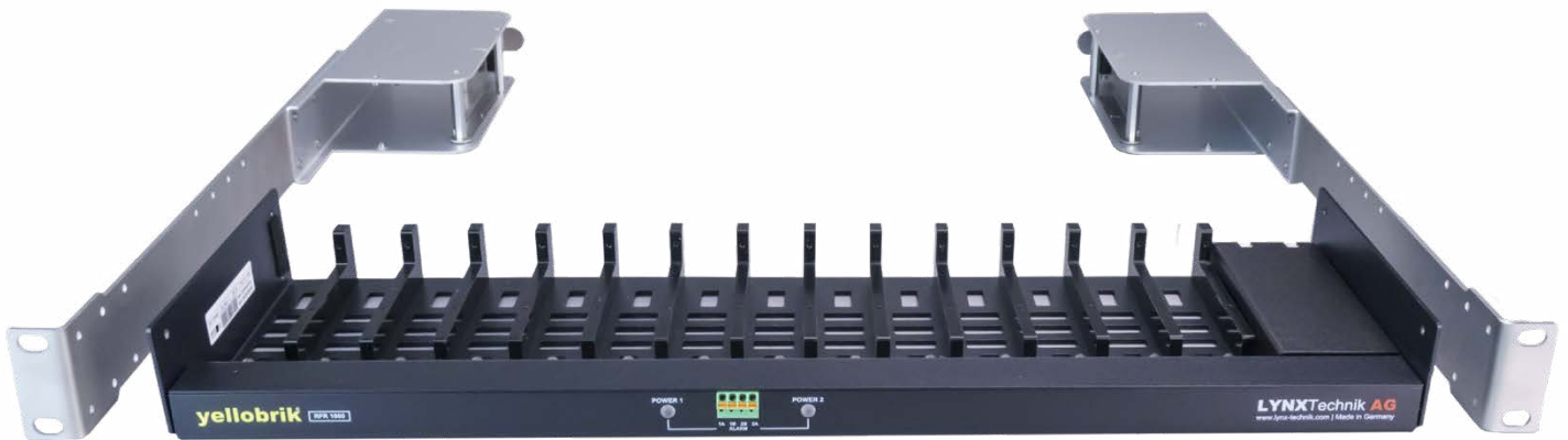
2 RXT 1001 displayed with RFR 1200