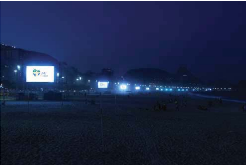
16 viewing towers along the Copacabana beach

These units supported the audio / video delay process to ensure accurate AV syncing across each and every viewing tower.