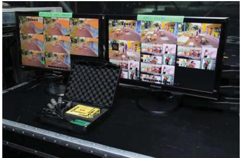
Signal monitoring with the yellobrik CDH 1813 SDI to HDMI Converters

These yellobrik's were outfitted with the OH-TR-1 fiber optic transceiver SFP modules, which added fiber SDI I/O capability for transmitting the SDI signals up to 10 Km.