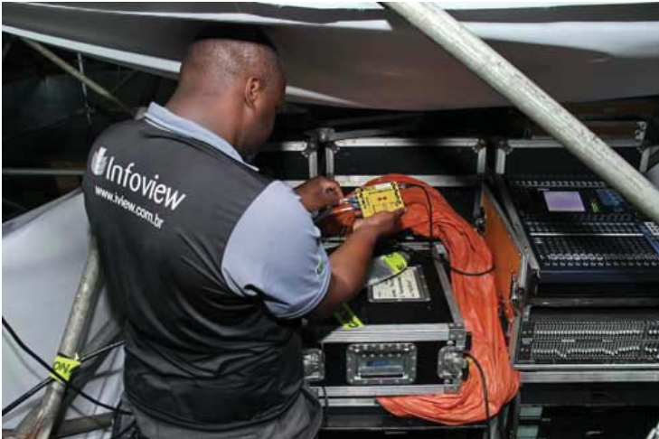
Infoview technician installs CDH 1813 SDI to HDMI converters

Infoview utilized yellobrik CDH1813 SDI to HDMI converters for transmitting and receiving signals from the stage front of house where the Pope inspired millions with his presentation.