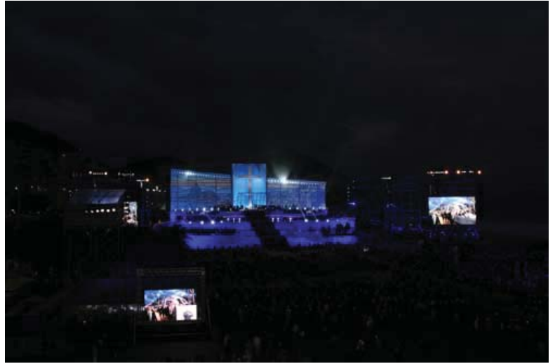
Front of house signals sent to LED viewing towers

For this devotional ceremony, Infoviev used the yellobrik PDM 1383 analog audio embedder to embed four analog audio signals from the front of house stage and deliver them to the Via Crucis production where additional PDM 1383 units de-embedded the analog audio channels.