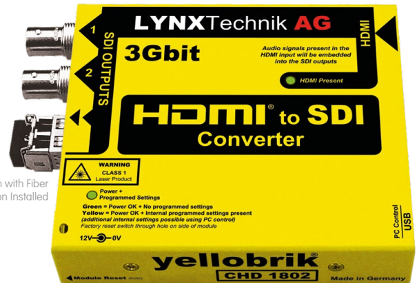
Shown with Fiber SFP Option Installed