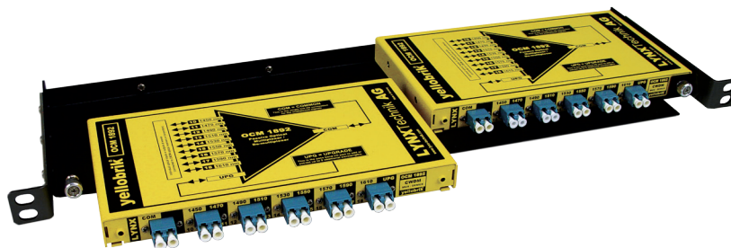
Optional RFR 1018 ½ RU 19" Rack chassis with 2 x OCM modules