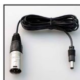
XLR 1000 Use with a standard 4 pin XLR camera battery power source.